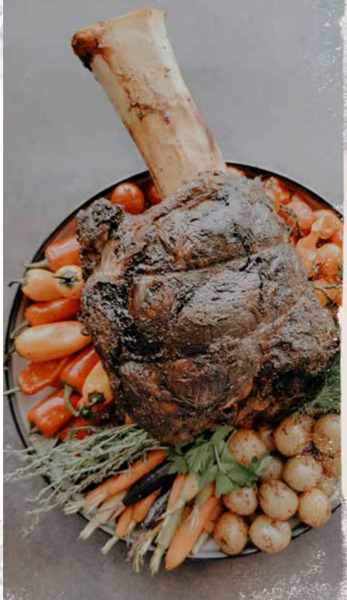
Beef Shank - Mother's Day